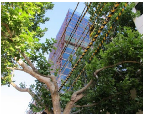
Local governments prefer tree species that are compatible with ground-based pruning.

The value expressed by home buyers in having street trees of mature age nearby also supports the investments that local government and developers made in the past. The increased premiums that buyers are willing to pay for these streetscape features translates to increased property values and tax revenues and support ongoing investment in planting, maintenance and protection of street trees within the urban environment.