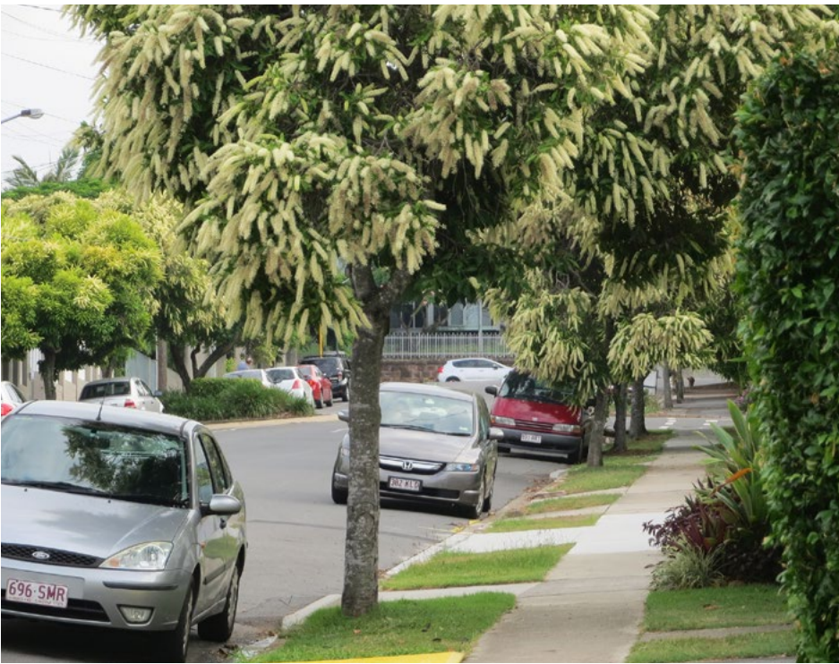
Mature trees provide a significant positive contribution to house sale price.

Street tree features were converted to two continuous, and up to four dummy, variables for each house sale. Dummy variables are used to test the contribution of just two scenarios for a particular attribute, such as footpath frontages with or without powerline constraints and the effect of mature and aged street trees compared to all other age categories. Features of street trees on the front footpath not found to be significant were not tested again in the nearby streetscape data set.