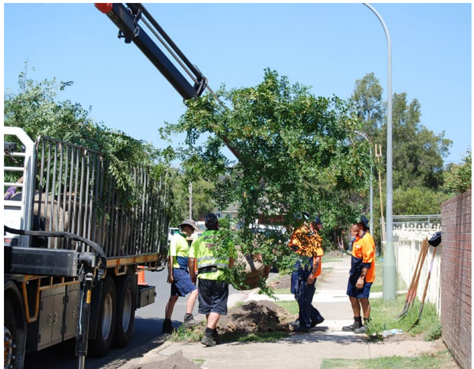
Mature trees provide a significant positive contribution to house sale price.

Street tree features on the front footpath explained 70.4 per cent of the variance in house sale prices of that sample. However, only one of the six street tree attributes was significant at the 90 per cent probability level. Street trees in the mature and aged (>16 years) category had a significant positive effect and, when other variables were held constant, these trees added a 6.92 per cent premium to median house sale price. However, the small sample size limits the robustness of this model.